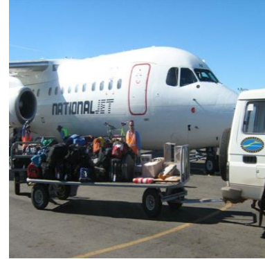
Driving a vehicle