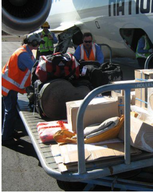
Loading and unloading luggage