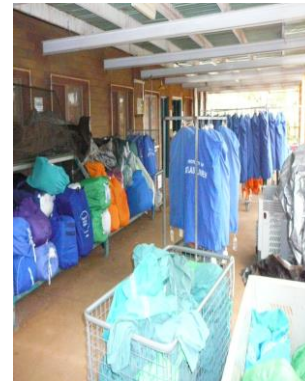
Use of cleaning agents and starches