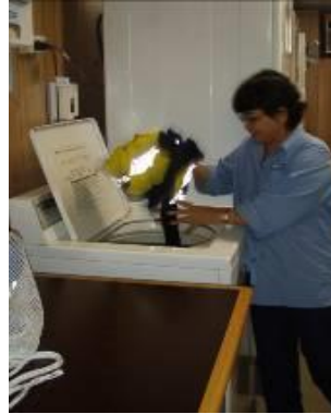
Sort and wash laundry