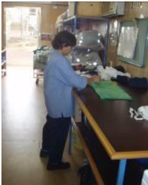
Iron, fold, hang and pack