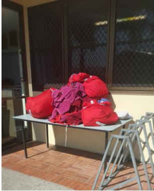
Collect and transport linen